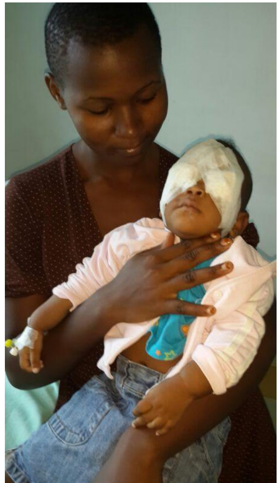
Baby with her mother after surgery