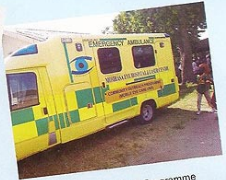
Community Outreach Programme (Mobile Eye Care Unit at the Camp Site)