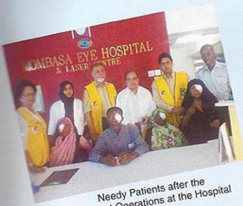
Needy Patients after the Cataract Operations at the Hospital