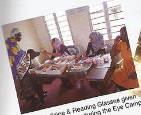
Free Medicine & Reading Glasses given to the needy Patients during the Eye Camp