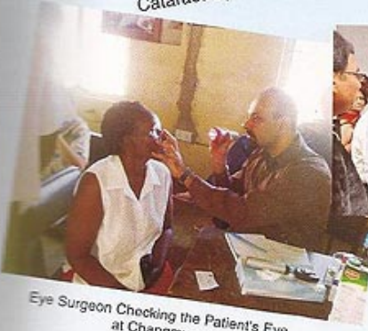
Eye Surgeon Checking the Patient's Eye at Changmwe