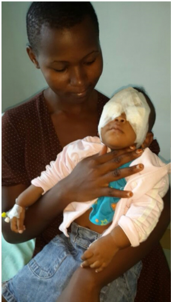
Baby with her mother after surgery