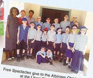
Free Spectacles give to the Albinism Children at the Likoni Blind School