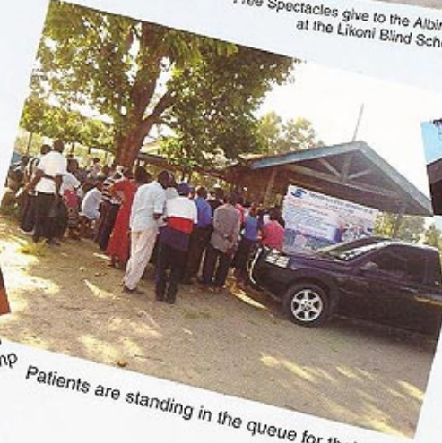
Patients are standing in the queue for their turn